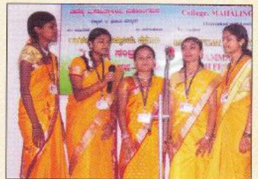
Group song Team