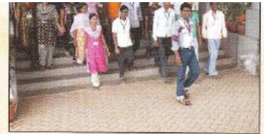
Towards the Future